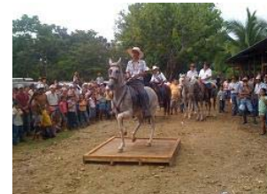
People from Portalón and many neighbors enjoying the day