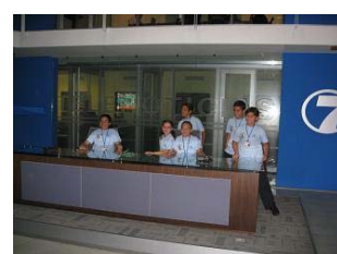
Booth at AmbientICE