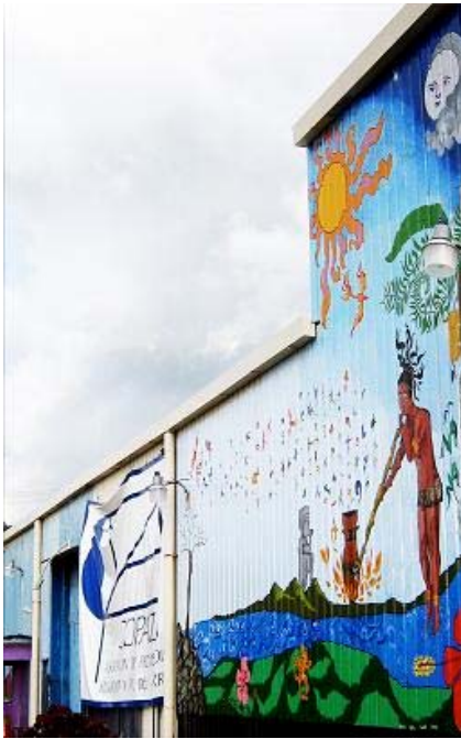
Portal del Pacífico

This building, in old days named PIMA and nowadays Portal del Pacífico , located in Quepos, close to the port, was given to COPAZA.