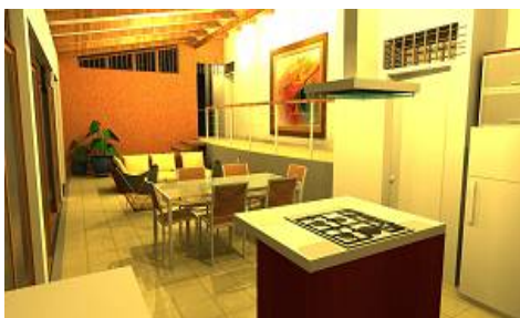
Ave del Paraíso - Inside