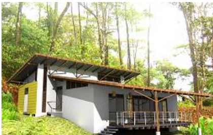
Ave del Paraíso