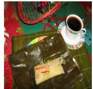
Costa Rican tamal & a cup of coffee!

Merry Christmas and a wonderful 2009. FELIZ NAVIDAD!