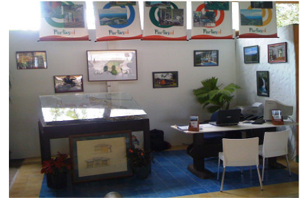
Remodeling done during November 2008